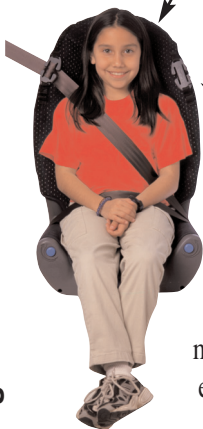
High Back Booster Seat

If your vehicle has a low back seat and your child's ears are above it, you need a high back booster seat to protect her head.