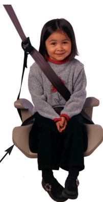
Low Back Booster Seat

These seats must be used with both lap and shoulder belts. Kids this size are too small to fit correctly in adult safety belts alone.